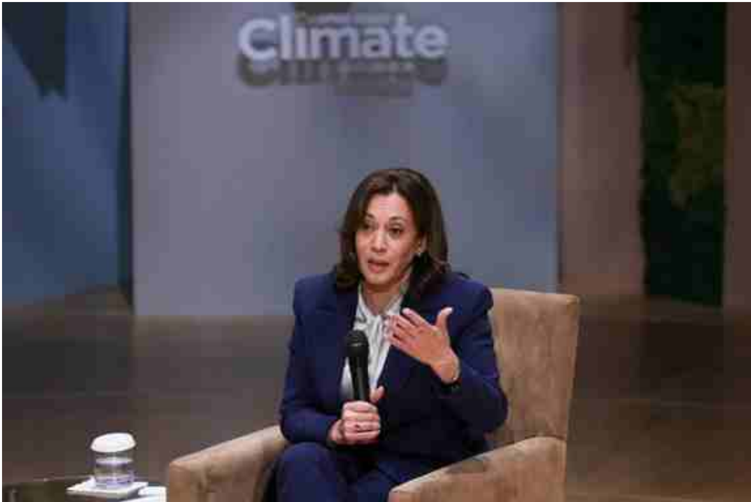
Kamala Harris

League of Conservation Voters Chair Carol Browner on advisory board of federal grant selectee